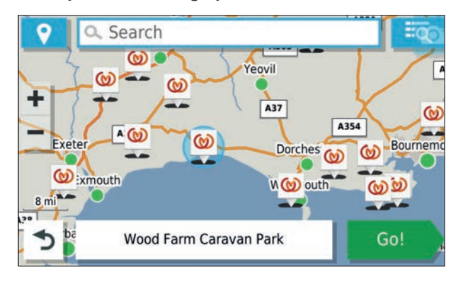
The Caravan and Motorhome Club Directory