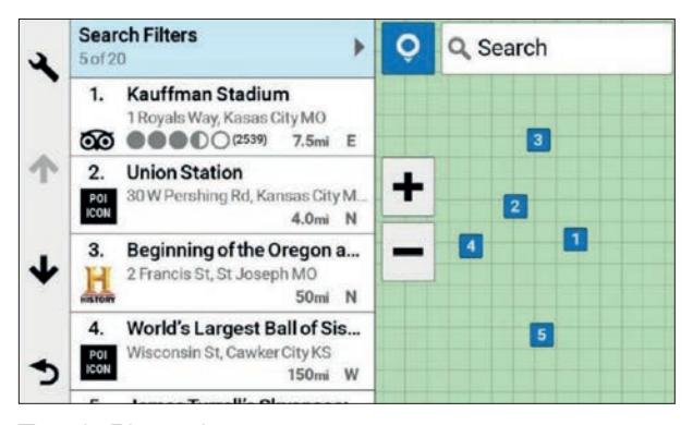
Trendy Places Locator