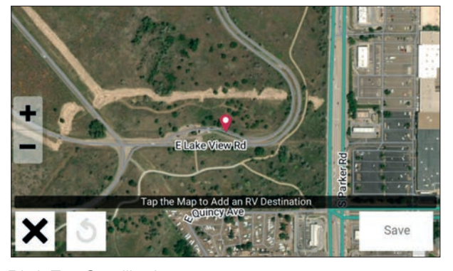
BirdsEye Satellite Imagery