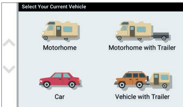
Caravan and Motorhome Profile